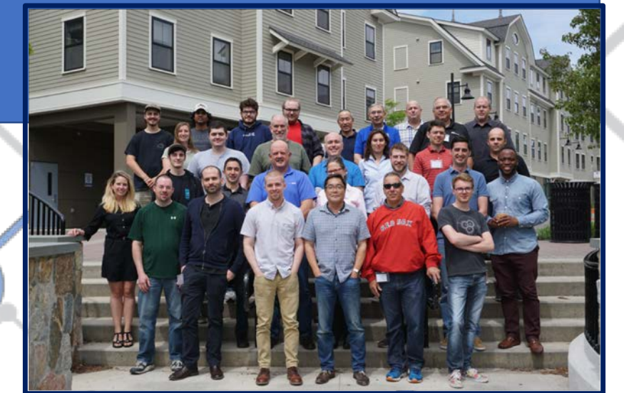
June 2018 NVMe Plugfest UNH-IOL Durham, NH USA

Since the original NVMe specification release in 2012, NVMe has proven to be a compelling low latency interface for connecting host systems with SSDs over PCIe. Complementing this, UNH-IOL (University of New Hampshire InterOperability Laboratory) has collaborating with NVMe Org to document and design NVMe test procedures and tools. This is the foundation for the NVMe interop and compliance program. Through this program, test services and tools are made available, as well as a series of plugfests. This has led to the creation of UNH-IOL INTERACT NVMe protocol test tools